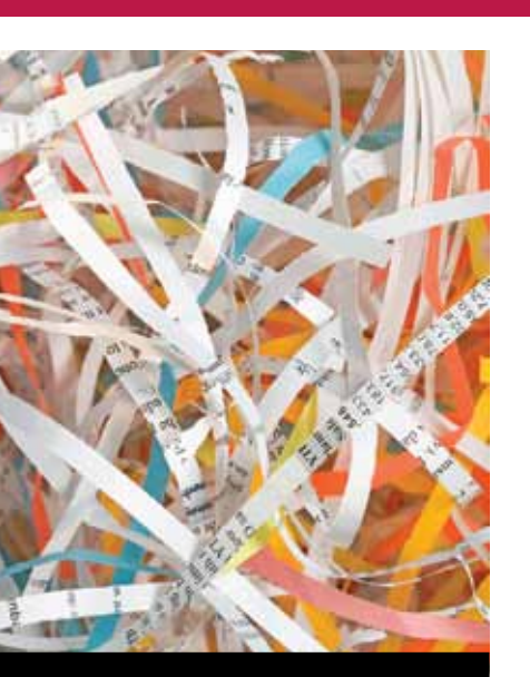
"Shred papers that have your personal information. Criminals obtain this information from trash cans or dumpsters."

Additional information can be obtained by calling 974-2859.