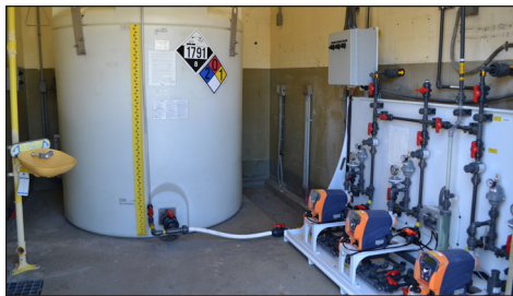
The new water treatment system (using sodium hypochlorite)

These hazards have led to approximately 96% of water treatment plants in the state of Florida converting to sodium hypochlorite. Because it is produced and stored as a liquid, the potential danger of having high-pressure chlorine gas on site is eliminated when using sodium hypochlorite.