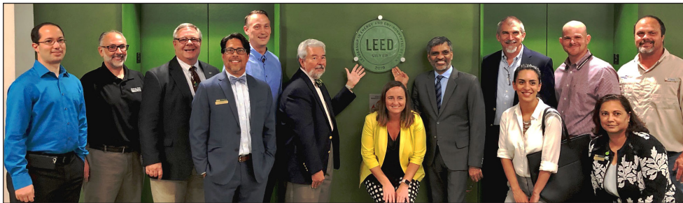
President and CEO of the USGBC presenting the LEED Silver plaque to the Dean of USF Libraries and the Design and Construction team from Facilities Management.

This month, the President and CEO of the USGBC came to the Tampa Bay area and visited the USF campus. Part of the visit was in regards to implementing the newest version of LEED. He also presented a LEED Silver plaque for the 5th Floor Library Renovation project. LEED Silver is a higher ranking than the normal LEED certification. A project’s ranking is determined by various sustainability factors, such as water efficiency, energy, and materials/resources, that can earn a project building points.