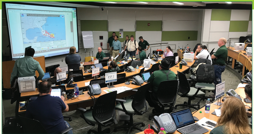
USF System Emergency Operations Center, staffed by numerous Emergency Support Functions or "ESF"s.

That afternoon the decision was made by USF senior leadership to close all System