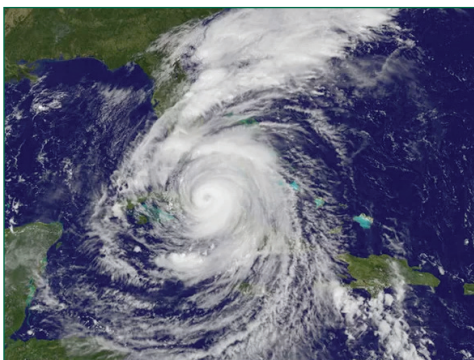
Hurricane Irma made landfall in the Keys as a Category 4 hurricane on the morning of September 10 with sustained winds of 130 mph.

Points of contact were established for students, faculty, and staff who needed assistance or had questions. Messaging to the USF community included links to the official USF Hurricane Guide and hurricane preparedness information on the USF Emergency Management website. As Hurricane Irma approached, the USF Emergency Management website jumped from an average of 68 visitors per day to over 17,200 visitors per day. The Dean of Students’ office became an information