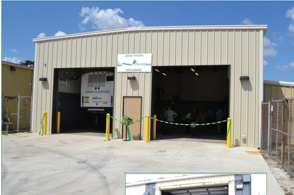
The new Bull Runner Garage (above) is a major improvement over the old workspace (right).