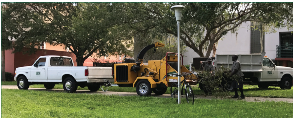
USF Facilities Management, Services personnel were on the job shortly after Irma passed, getting the campus cleaned up and looking great!

While, as always, there are plenty of improvements that can be made based on lessons learned, overall those involved in this event did an excellent job for the USF System and should be proud! Go Bulls!