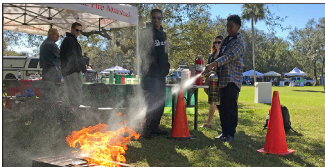
USF Environmental Health and Safety personnel teaches student how to properly put out a fire using a fire extinguisher at a previous Campus Safety Day event.

Throughout the month of October, The University of South Florida Police Department and USF Department of Emergency Management will be hosting free safety education events and trainings for students, faculty, and staff. These trainings touch on a number of safety-related issues that impact the USF campus, such as active threats, hands-only CPR and First Aid, and self-defense. If you would like to view the full schedule of educational events and trainings happening during Campus Safety Awareness Month, visit bit.ly/SafetyMonthTraining . You will also receive an entry into a raffle every time you attend a training course during NCSAM.